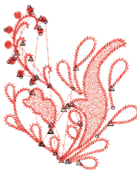
Design contains many time-wasting trims.

Select a group of objects of the same color. By applying Branching , ES will automatically sequence the objects, creating travel runs to avoid trims. This otherwise manual procedure is done in a matter of seconds, and can save you expensive machine time by avoiding unnecessary trims.