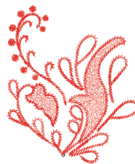
Design automatically sequenced with Branching.